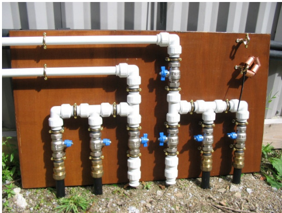
Fig 2- 2 way universal manifold (set for left handed)

Any ground pipes inside the building should be insulated using a vapour barrier insulation, such as "Armaflex" to prevent dripping from condensation. Any pipe outside the building need not be insulated since the circulating fluid contains anti-freeze.