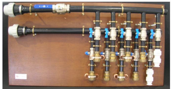
Fig 3- 4 way 'left' handed manifold